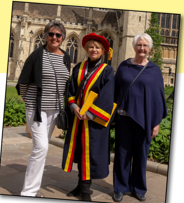
Chartered Freeman is a very ancient tradition and I am very proud of my connection with the City of Gloucester and its heritage"

After the tour she said "I am pleased to be able to wear my Chartered Freeman's robes when I undertake Tours of Gloucester as a trained Civic Trust Guide and I hope it helps great value in medieval times but are not to promote what we do for the city and creates usually taken up these days, for obvious more awareness of our Guided Tours. Being a