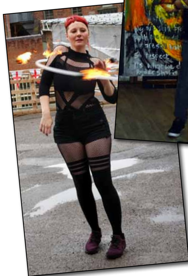
▶ LEFT: People were welcomed to the event by a "fiery Hula Hoop" dancer!

An important part of SOMAC is the Gloucester Music Festival which this year has events in two venues recently renovated in the City, St Mary deCrypt and Llanthony Priory. The Festival is organised by